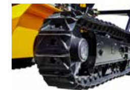
STEEL TRACKS (optional)

Hydraulic variable track system with independent undercarriage frames and an automatic tensioning system built to work in the toughest conditions, thanks to a rubber tracks structure, oscillating roller system and triple-flange idlers.